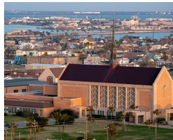
Moody Methodist Church

The Texas Music Office (TMO) of the Office of the Governor awarded Galveston College Community Chorale $700.00 as part of their Live Music Grant Program. The objective of the Live Music Grant Program is to provide free music by Texas music acts to the general public.