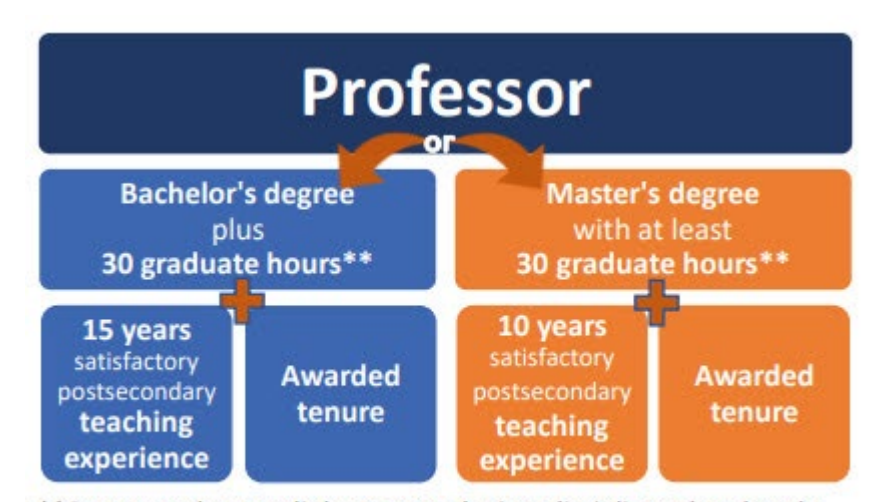
**Postsecondary credit hours must be in a discipline related to the teaching field, beyond those hours required for the degree.

• OR have earned a master's degree with at least thirty (30) graduate hours in a discipline related to the teaching field AND ten (10) years satisfactory postsecondary teaching experience AND be awarded tenure.