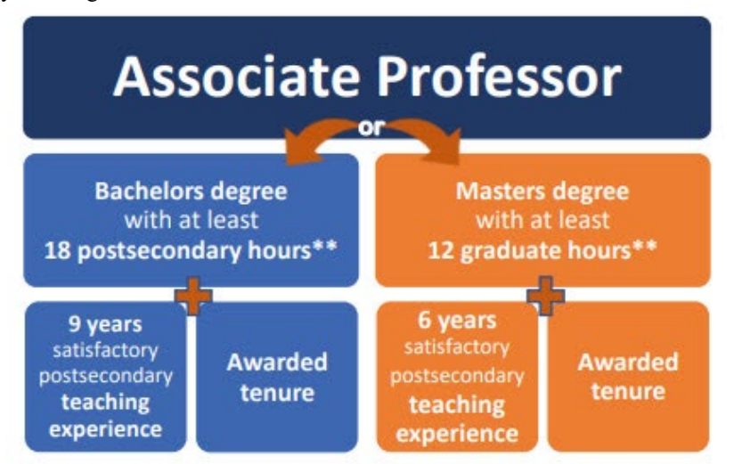
**Postsecondary credit hours must be in a discipline related to the teaching field, beyond those hours required for the degree.

• OR have an earned master's degree (not necessarily in the teaching field) with at least twelve (12) graduate hours in a discipline related to the teaching field AND six (6) years of satisfactory postsecondary teaching AND be awarded tenure.