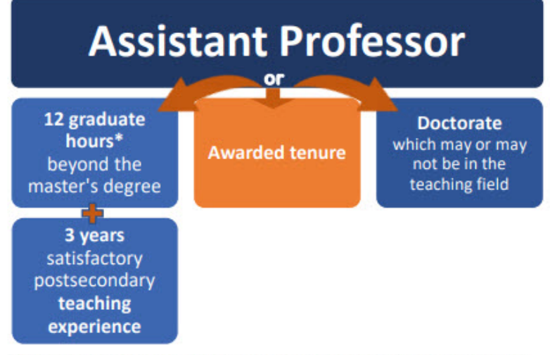
*Graduate hours must be in a discipline related to the teaching field, beyond those hours required for the master's degree.