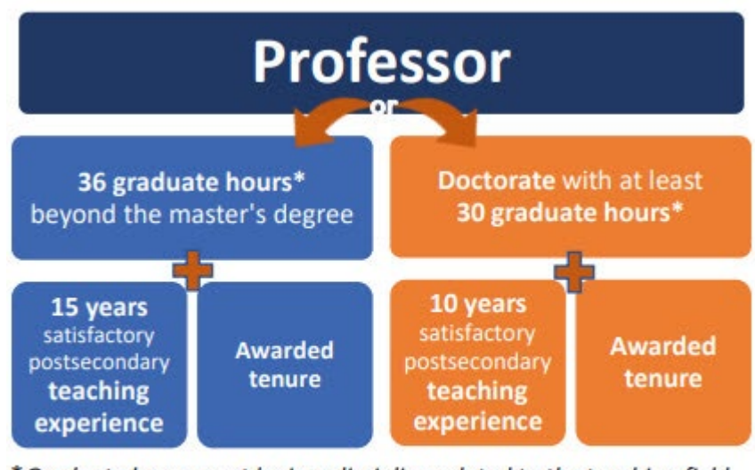
*Graduate hours must be in a discipline related to the teaching field, beyond those hours required for the master's degree.

• OR have an earned doctorate (not necessarily in the teaching field) with at least thirty (30) graduate hours in a discipline related to the teaching field AND ten (10) years of satisfactory postsecondary teaching experience AND be awarded tenure.