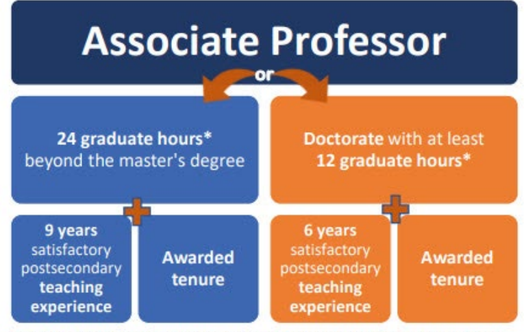
*Graduate hours must be in a discipline related to the teaching field, beyond those hours required for the master's degree.

• OR have an earned doctorate (not necessarily in the teaching field) with at least twelve (12) graduate hours in a discipline related to the teaching field AND have six (6) years of satisfactory postsecondary teaching experience AND be awarded tenure.